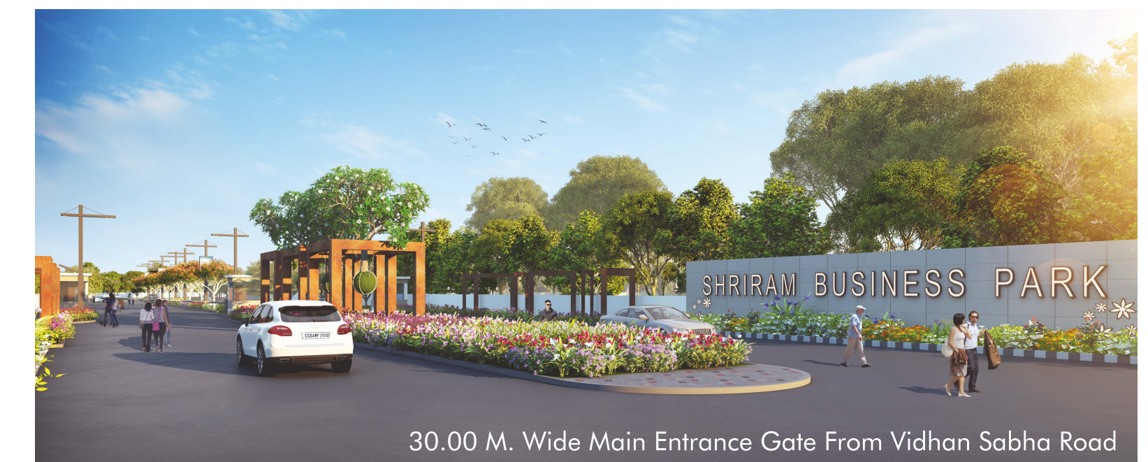
30.00 M. Wide Main Entrance Gate From Vidhan Sabha Road