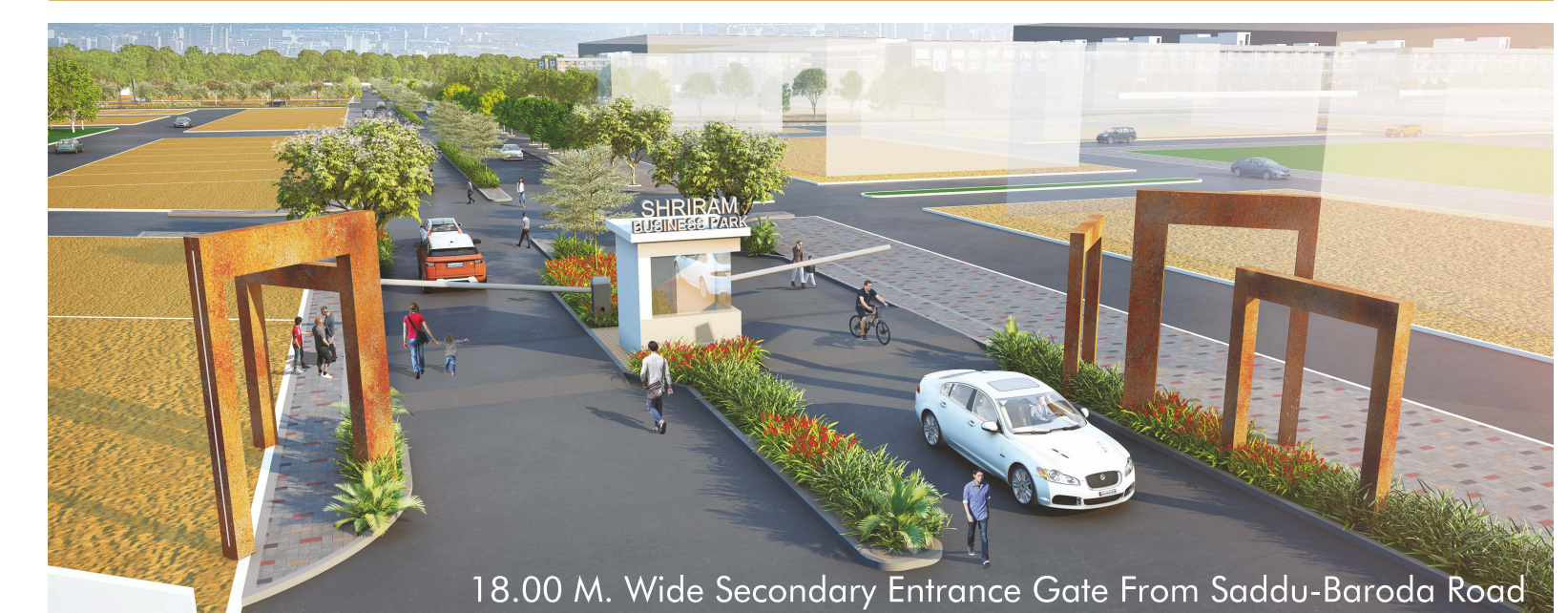
18.00 M. Wide Secondary Entrance Gate From Saddu-Baroda Road

A magnificent entrance welcomes you to Shriram Business Park, leaving at once a promising impression upon your mind. A 30 m entrance road passing through the center and connecting all the parts of the site leads you to the open courts, circumscribed by the shop blocks – all clearly tagged, and you are further enchanted by the clarity of space, flamboyantly painted courtyards, and the lavish landscaping around.